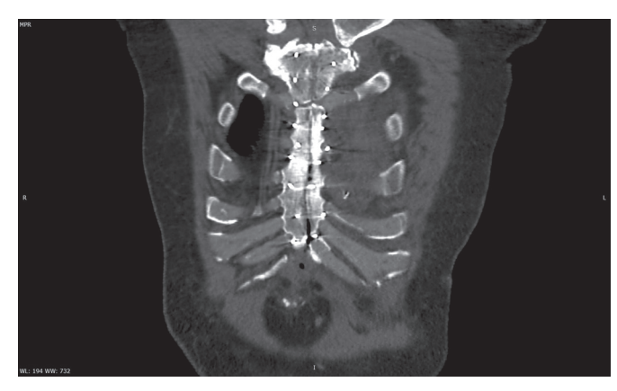
Fig. 1A. Frontal CT scan of the sternum

As the control CT study has shown, foci of the destruc-