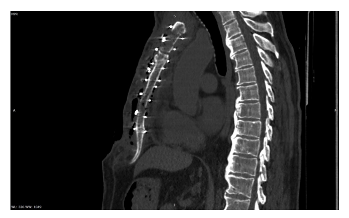
Fig. 1B. Sagittal CT scan of the sternum

tion of the sternum edges remained, the rest of the sternum contours were clearer, gas bubbles were not detected, infiltrative changes in the subcutaneous tissue and mediastinal tissue were not detected, yet the pericardium was still thickened in the anterior sections.