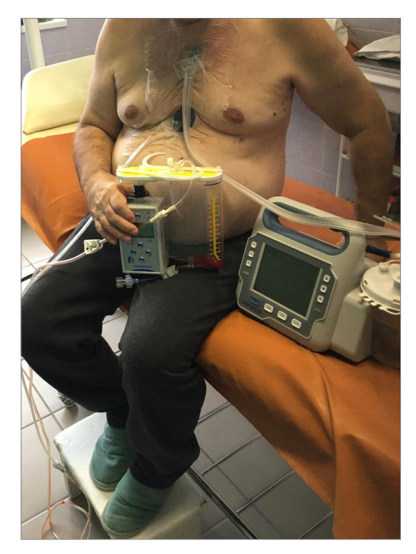
Fig. 2. Installation of a "double" VAC system

The mechanism of influence of NPWT in patients with complications after sternotomy is similar to its influence when used for the treatment of soft tissue defects. Among the main efficiency factors of NPWT are macro-deformation, micro-deformation, changes in perfusion, control of