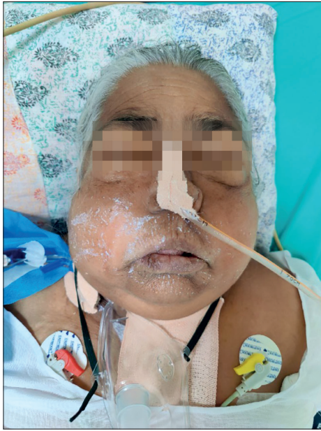
Fig. 1. Clinical photograph showing facial surgical emphysema extending from scalp to the neck region