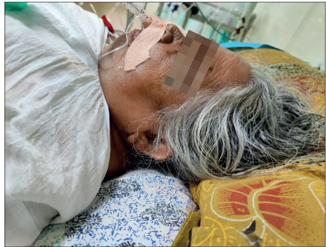
Fig. 6. Lateral view showing resolution of surgical emphysema (24 hrs after admission)

breathlessness, and saturation was at 95% at room air. In view of the increasing emphysema, trachea was electively intubated. The patient was closely observed and was kept with head-end elevation. She was transferred to surgical intensive care unit and was closely monitored.