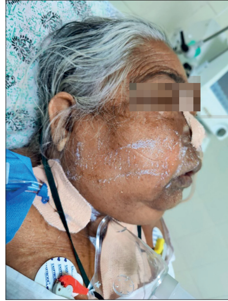
Fig. 2. Lateral photograph of the face with subcutaneous emphysema

was given; the patient underwent plain computed tomography (CT) of the brain which showed no abnormalities, facial bone/sinus fractures or parenchymal bleed.