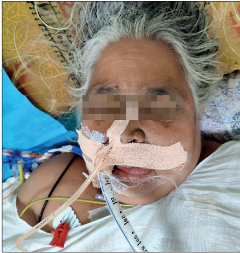
Fig. 5. Clinical photograph showing resolution of surgical emphysema